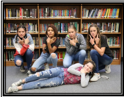
7th grade “Setsy Ladies”