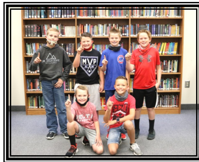
6th grade “Rainbow Sparkles”