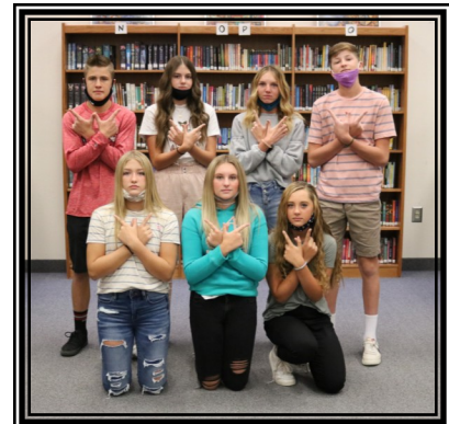
8th grade “Boujee Turdeto Wahaha”