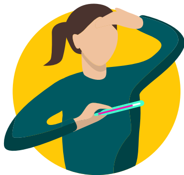
Fever (temperature of 100.4°F or 38°C or higher or feeling feverish)

If you can't do a temperature check on a student, teacher, or employee, ask the person if he or she is feeling feverish (the person's skin may feel hot or be red, or he or she may have chills or be sweaty).