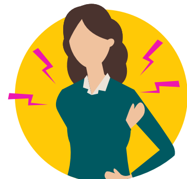
Muscle aches and pains

Visit the Centers for Disease Control and Prevention (CDC) website to find out other symptoms that may be associated with COVID-19.