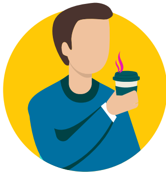
Decrease in sense of smell or taste