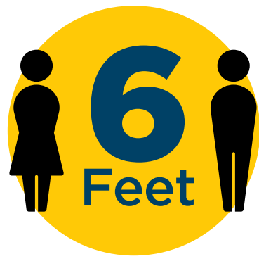
For 15 Minutes

Anyone who was in close contact with a person who has COVID-19 up to 2 days before he or she had symptoms or tested positive is considered exposed and should quarantine for 14 days.